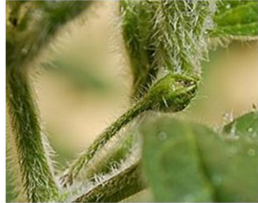
Flower bud of a Solanum quitoense leaf