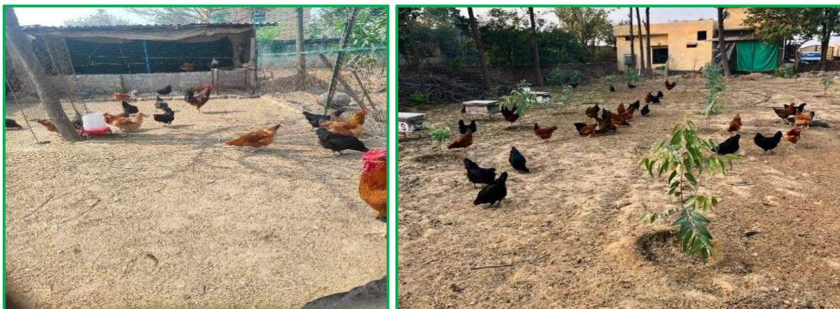
Figure 3. Free range Poultry

Poultry: Navi Farms has a free-range poultry as Mr. Narendra believes that these animals grow best in their natural state without being caged. Mr. Narendra started the poultry business through self-financing in 2025. Navi farms hosts chicken varieties of Rhode Island Red which produces 150 eggs /year, Black Australorp which produces around 200 brown eggs per year. Navi farms sell each desi egg at the rate of 15 Rs per egg. Each day his egg production is up to 60 eggs which brings out his revenue to roughly 900 per day from chicken eggs alone. Furthermore, Navi Farms raises guinea fowls, duck and chicken pairs for sales to other farmers who wants to establish their own poultry farms.